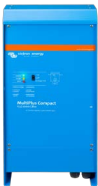
MultiPlus Compact 12/2000/80

When connected to the Ethernet, systems with a Color Control panel can be accessed remotely and settings can be changed.