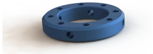
Figure 1: Fastner ring